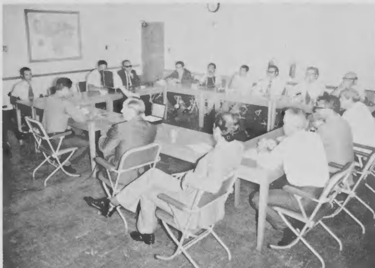
Radio, Press and TV representatives during press conference announcing Lago's tenth first-place NSC award.

Printed by: Verenigde Antilliaanse Drukkerijen N.V.